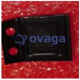
ADV7391WBCPZ Analog Devices, Inc LFSCP-3