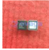
ADV7393BCPZ Analog Devices, Inc LFCSP-VQ-40