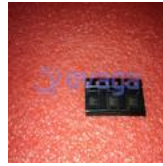
ADV7390BCPZ Analog Devices, Inc QFN32