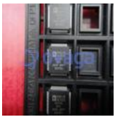
ADV7341BSTZ Analog Devices, Inc LQFP-64