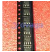
AD8170AR Analog Devices, Inc SOP8