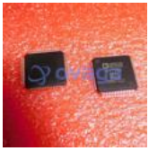
ADV7181CBSTZ Analog Devices, Inc LQFP-64