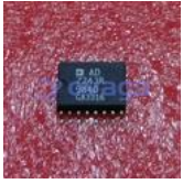
ADV724JR Analog Devices, Inc SOIC-16